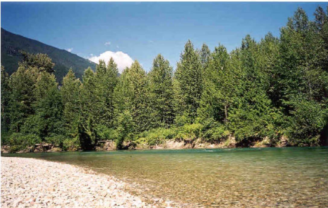
Figure 2: Salmon spawning area near km 42 Nahatlatch River.