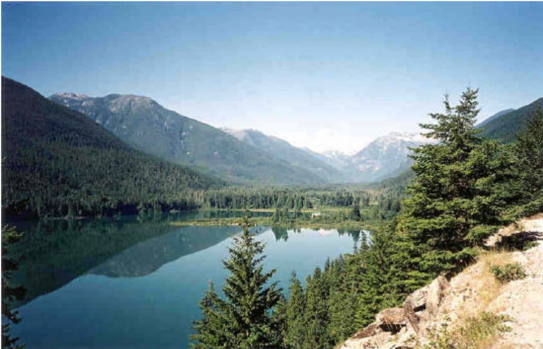
Figure 3: Nahatlatch Provincial Park is located in the lower third of the valley.

Unlike the Stein Valley and Mehatl Creek parks, both of which encompass entire watersheds, Nahatlatch Provincial Park forms a small component of the overall watershed, its boundaries outlining the linear river and lake systems.